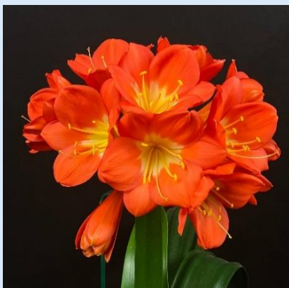
What a Doll