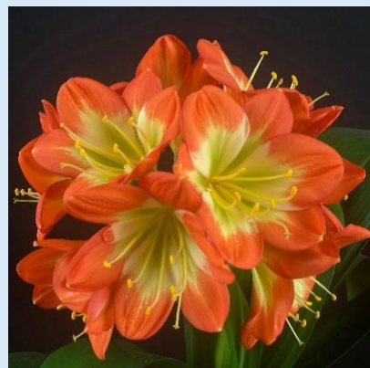
Tanika x Tancho