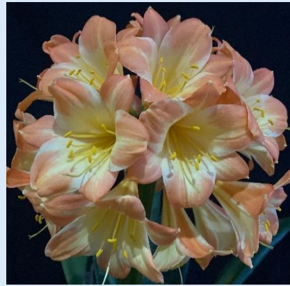
Chiffon Daughter Breeding