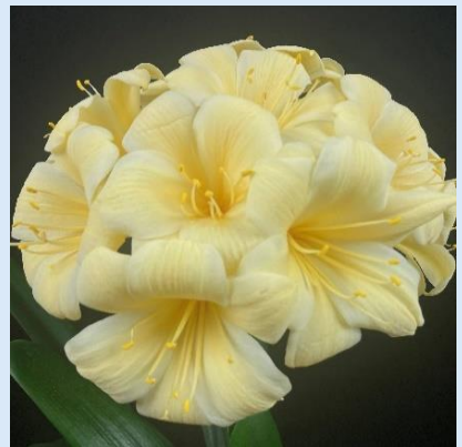
Yellow Gr 1