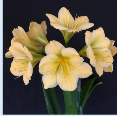
Yellow Gr1 GT